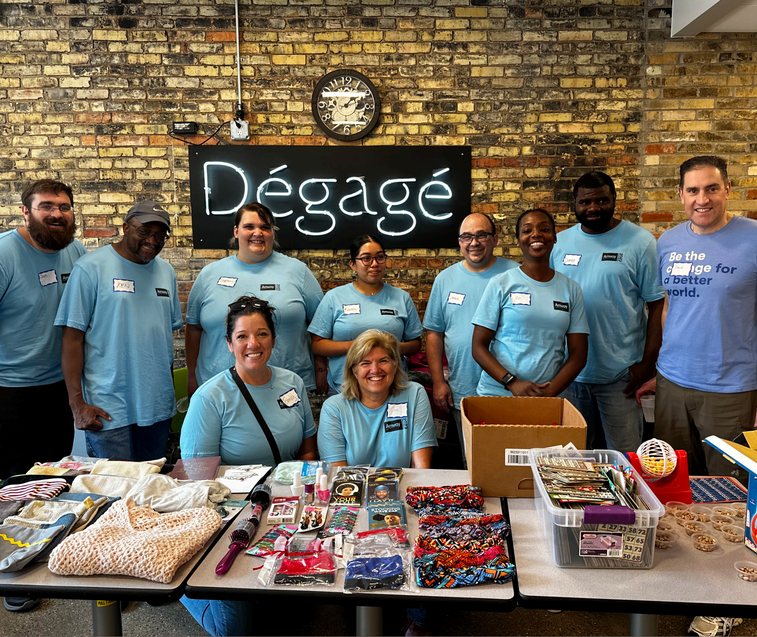
Volunteers hosting Bingo