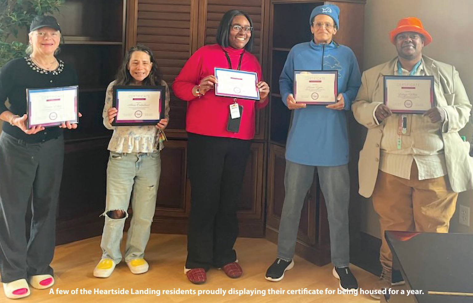
A few of the Heartside Landing residents proudly displaying their certificate for being housed for a year.

JEREMIAH 29:11 ( The Dégagé 2024 verse of the year )